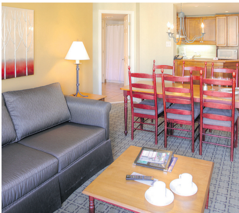
The hotel rooms and suites at Place St-Bernard, at the heart of Tremblant's mountain resort, are well-priced and practical. TREMBLANT

tion desks have maps, and the trails, straight up or winding, run between 2.5 and six km.