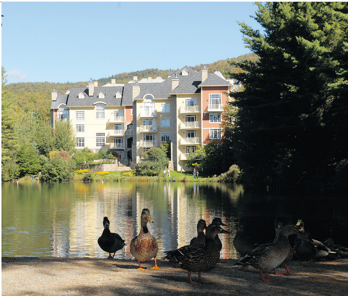
The slopeside condos at the Bondurant are among the most luxurious at the Tremblant resort, with views of either Mont Tremblant or tiny Mirror Lake. TREMBLANT

Or, if you're into heart-thumping cardio, you can hike up several paths to Tremblant's summit. The activity centre and informa-